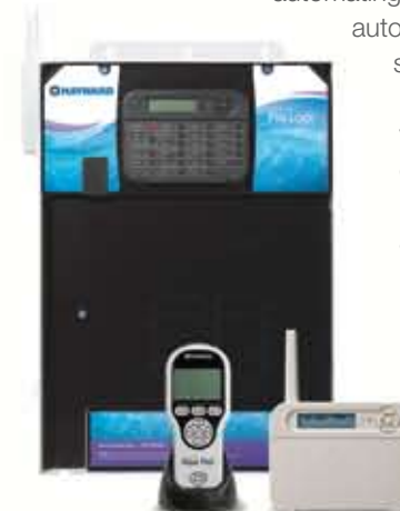
An optional remote gives you fingertip control from anywhere in your backyard.

With so many color and thematic options to choose from, you can literally create any ambiance you want, from serene, hypnotic moods to vibrant, charismatic displays. Create colorful wave-like patterns and other visual effects by altering speed, motion and brightness.